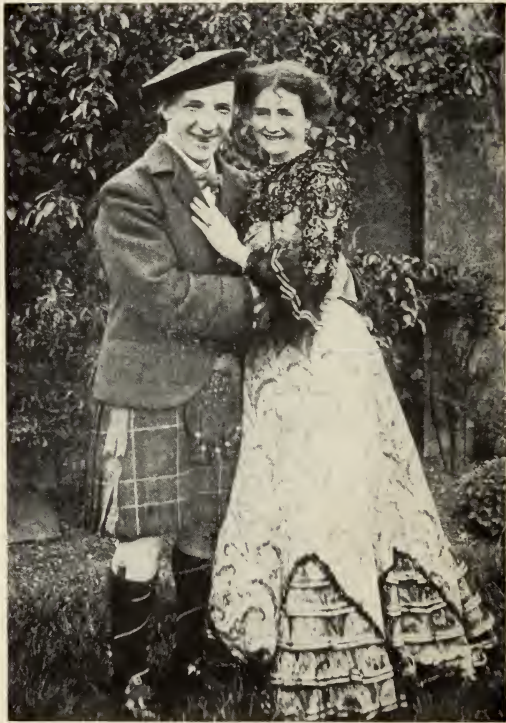
SIR HARRY AND LADY LAUDER TWENTY-FIVE YEARS AGO